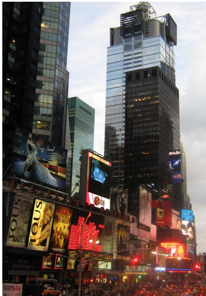
Above: Times Square - 24 hour daylight