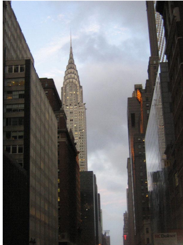
Left: The gorgeous Chrysler Building at sunset

Agent G recently jetted across the Atlantic on a research trip to New York, New York: "Phew! What a city! Rather than launch into a lengthy and exhausting monologue about the trip - because lets face it, enough has been said of New York - I'll just let the pictures do the talking..."